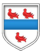
Bishop Walsh Catholic School